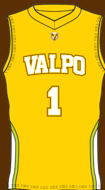
Replica Valpo Basketball Jersey