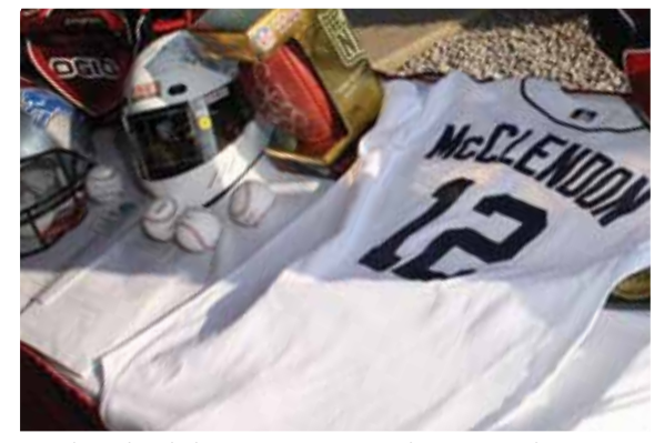
Valpo-related silent auction items run the gamut at the event. Proceeds benefit the Athletics Department.